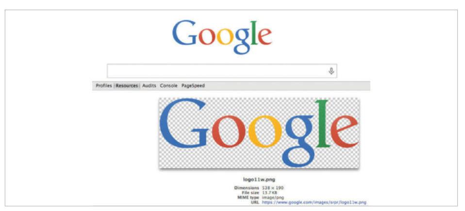
Retina resolution Here the size at which the Google logo is displayed is smaller than the size of the logo file

Note that optimising an SVG using SVGO could change the SVG document structure and might eventually affect any scripting and animations you have applied, so choose your optimisations wisely. If you are only going to use the SVG as a static image, you won't have anything to worry about – just make sure the SVG viewBox is preserved.